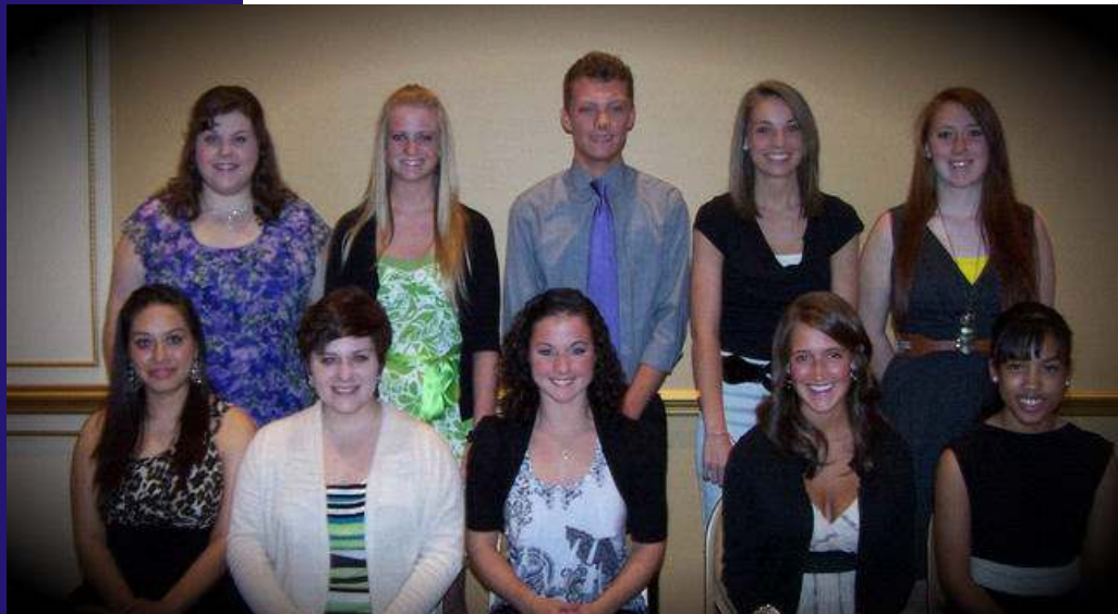
Lilly Endowment and the Keene-Is-Pedersen-Wells Scholars