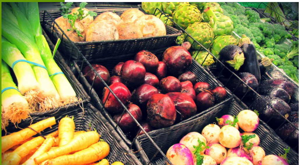
Elkhart County Food Pantries

(H & H Services Grants continued Page 14)