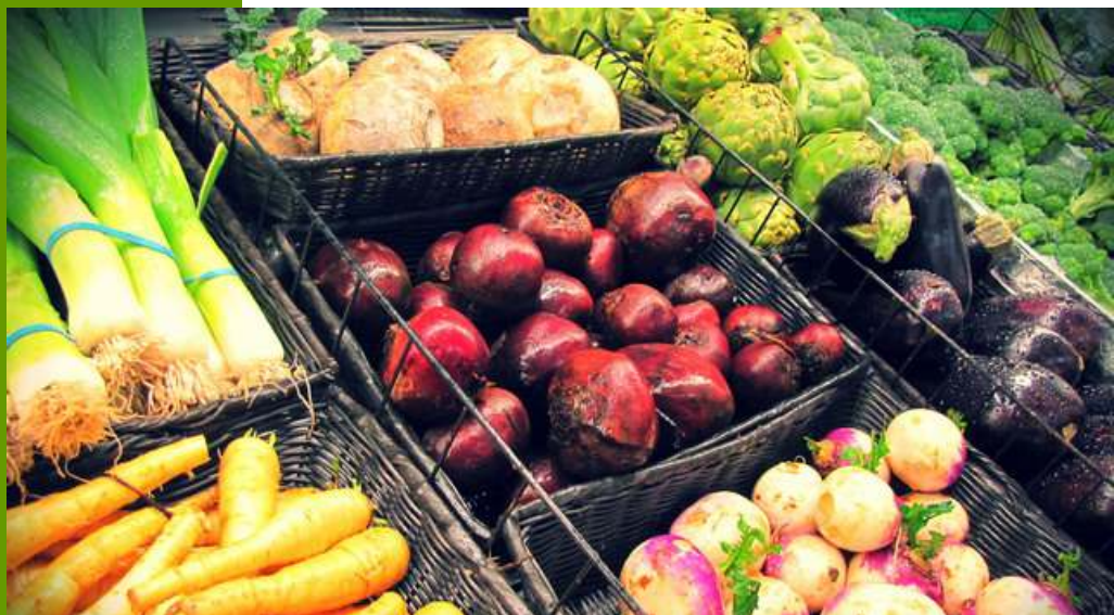
Elkhart County Food Pantries

(H & H Services Grants continued Page 14)