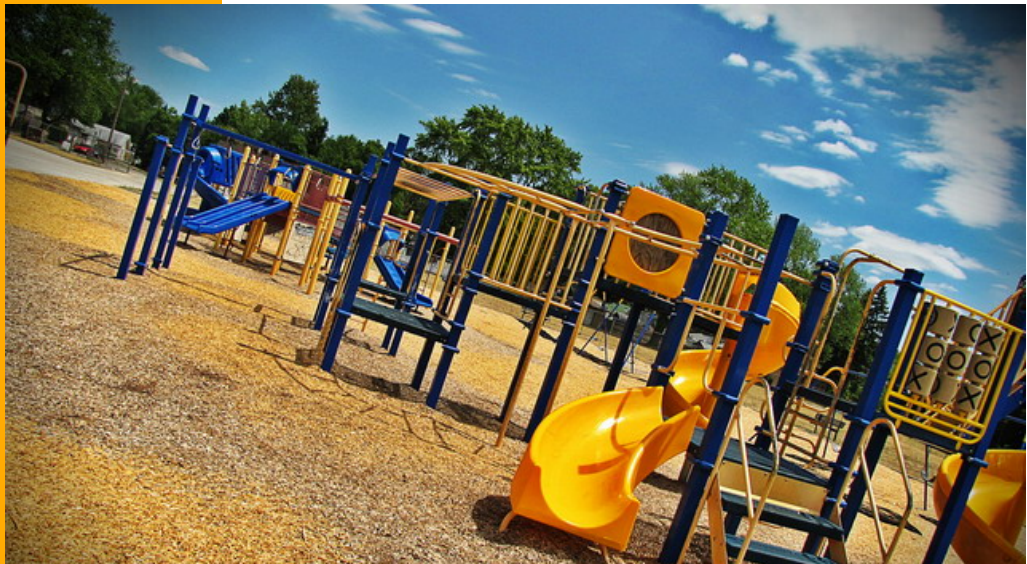
Beardsley Elementary School