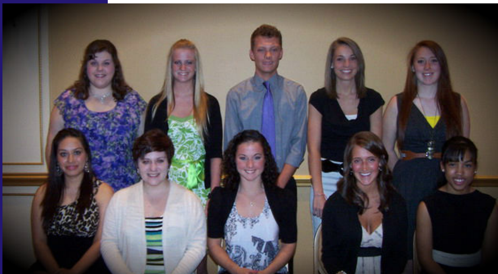
Lilly Endowment and the Kegerreis-Pedersen-Wells Scholars