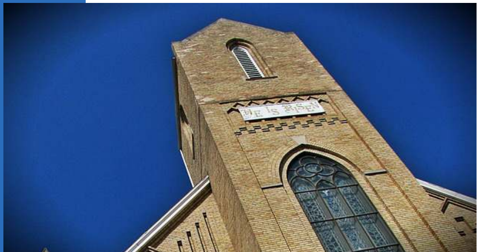
St. Vincent De Paul Catholic Church

We believe in helping our donors and our community support the programs of faith-based institutions in our County, regardless of their specific religious convictions. From putting new roofs on aging structures, security measures for day-cares to St. Vincent De Paul's ESL and GED Programs, and providing support to the Chaplaincy Program of the Elkhart County Sheriff's Department, we support the good works of the se partners.