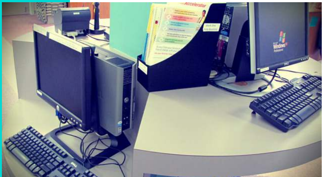
Elkhart Library -- Dunlap