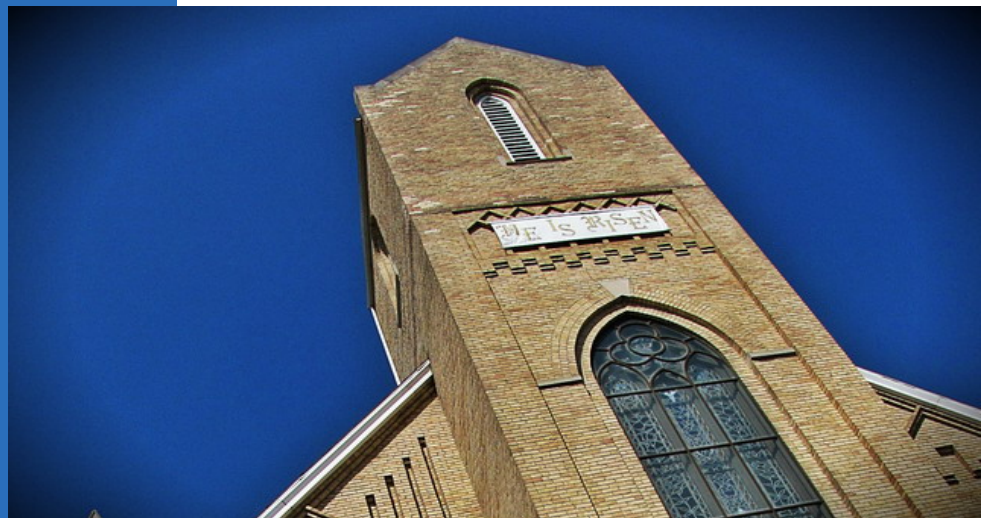
St. Vincent DePaul Catholic Church

We believe in helping our donors and our community support the programs of faith-based institutions in our County, regardless of their specific religious convictions. From putting new roofs on aging structures, security measures for day-cares to St. Vincent DePaul's ESL and GED Programs, and providing support to the Chaplaincy Program of the Elkhart County Sheriff's Department, we support the good works of these partners.