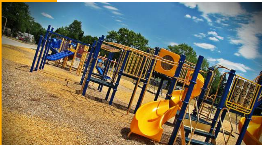
Beardsley Elementary School