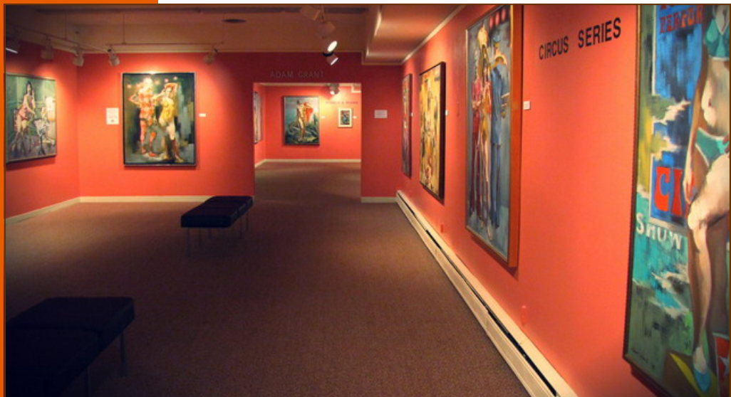
Midwest Museum of American Art

Strengthening arts and culture – through skills like effective fiscal management and entrepreneurial creativity – enables art to be a critical ingredient in helping communities build cohesion among residents, facilitate civic dialogue, grow and thrive.